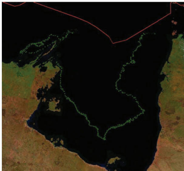
Figure 3 An example of the drifting pattern of a tracked net (with geolocator) in the GOC. The net (green dots show track locations) validates our model, showing the pattern we predicted and highlighting the lack of ghostnets arriving in the southern Gulf.

mortality in Australia and the primary one reported in the Gulf region, and Australia has 6 of the 7 threatened marine turtle species, including large portions of the remaining global populations for several species (Limpus & Fien 2009; Biddle & Limpus 2011). Mapping predicted encounters, we found that risk is high not only where entangled turtles have been observed, but also in the southwestern GOC in an area that was not identified from the strandings data: a prediction that could not be made in the absence of our integrated analysis. Furthermore, testing our approach in a geographic region where there are good data are critical for assessing its utility in other regions.